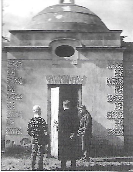
The Nash Mausoleum at Farningham possibly by Nash, 1775 and below, the Sacheverell-Bateman Mausoleum by Bodley, at Morley.