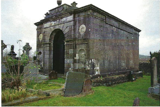
The Templetown Mausoleum at Templepatrick, by Adam