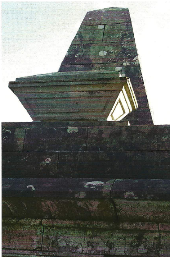
Egyptian style Greer mausoleum

The parish-churchyard at Desertcreat, County Tyrone, is of considerable interest. South of the church, by the vestry door, is an early eighteenth-century stone slab decorated with a raised crozier and mitre, but there are also two large mausolea among the tombs. The first, in a commanding position on high ground, is that of the Greer family dating from 1840. It is of a Neo-Classical cubic form. Atop is a stumpy obelisk, and over the entrance is a large ash-chest. The style of the architecture has an Egyptian flavour, a curious rarity in the rolling Ulster countryside (see below).