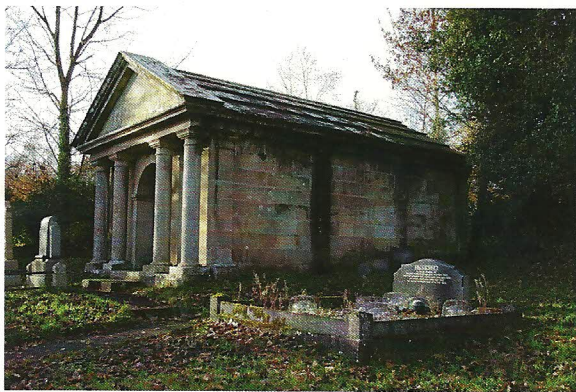
Burges family mausoleum at Castle Caulfield