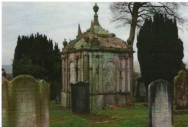
The Waddell Cunningham Douglas Mausoleum waits patiently for its restoration

On my first visit I was taken to the parish-churchyard at Knockbreda (now in a suburb of Belfast) to see three of the most attractive mausolea in Northern Ireland. Long neglected, like most mausolea from the eighteenth century and later, they stood forlornly in the churchyard, their roofs festooned with plants which could so easily have been removed but which were adding to the decay by taking root and pushing the stones apart. It was a melancholy sight, but on my last visit two of the three (all dating from the 1790s) were surrounded by scaffolding, as funds have been raised by The Follies Trust (see details below) to repair them. The Greg and Rainey mausolea will, if all goes to plan, be restored to their full splendour within a couple of years. The third, the Waddell Cunningham Douglas mausoleum, will have to wait for more money to be collected. A member of the Greg family has recently been contacted, and lent support for the restoration which has added to the general enthusiasm.