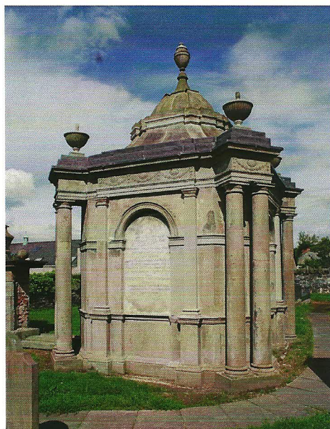
The Rainey mausoleum, restoration complete (Summer 2009)