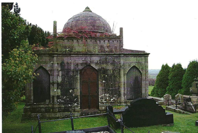
The Stephenson Mausoleum at Kilbride